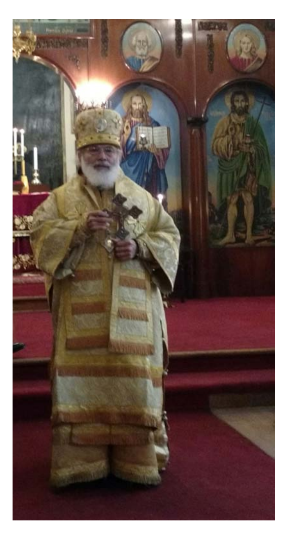
METROPOLITAN JOSEPH'S SERMON, DELIVERED AFTER DIVINE LITURGY SUNDAY, OCTOBER 29, 2017

The Proverbs says: "Where there is no vision, the people perish".