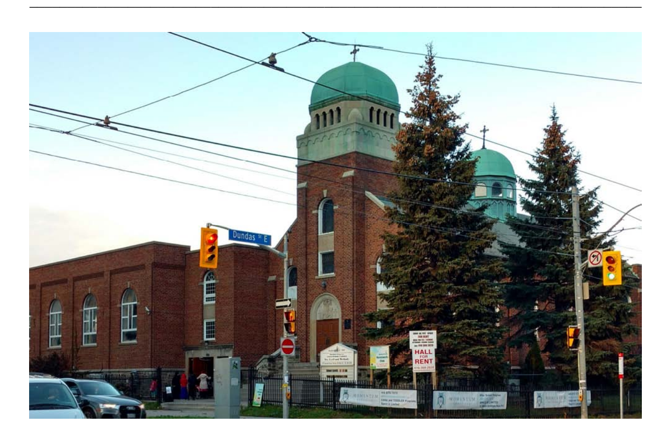
Saturday, October 28, 2017 (Vesper Service):