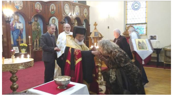
Blessings and nafora after Service / Благословия и нафора след служба