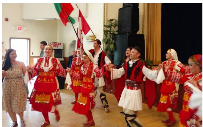
Celebration finished with horoes/ Тържеството завърши с хора