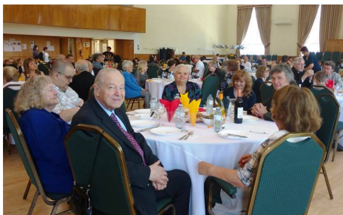
Church Long-time members / Дългогодишни членове на църквата