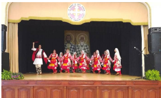
Dancing Group "Igranka" / Танцова група „Игранка“