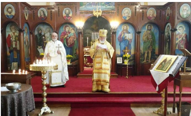
Pontifical Holy Liturgy/ Епархийска Света Литургия