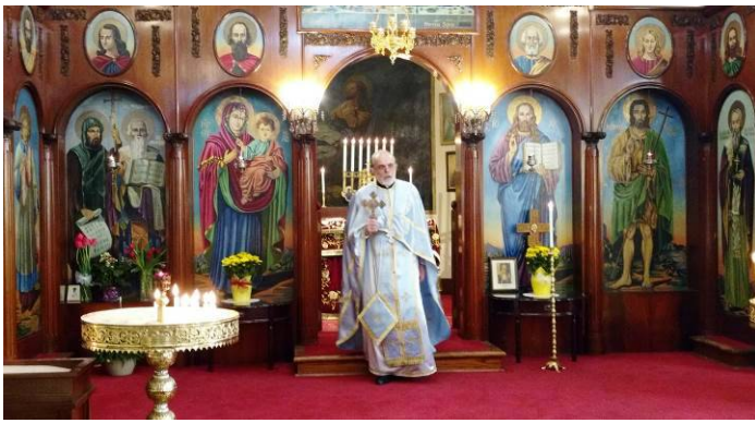
Holy Liturgy honoring Sts. Cyril & Methody / Св. Литургия