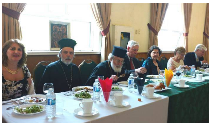
The guests of the Head Table / Гостите на главната маса