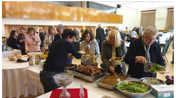
People enjoying the roasted lamb / Хората се радват на печеното агне