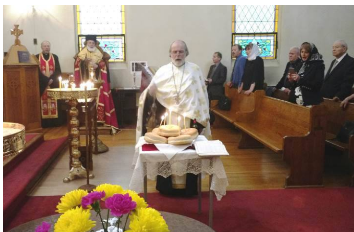
Five-bread Service for health and prosperity of the faithful Петохлебие за здраве и просперитет на присъстващите