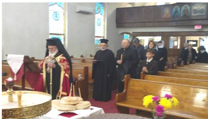
Metropolitan Joseph entering the church Митрополит Йосиф влиза в църквата