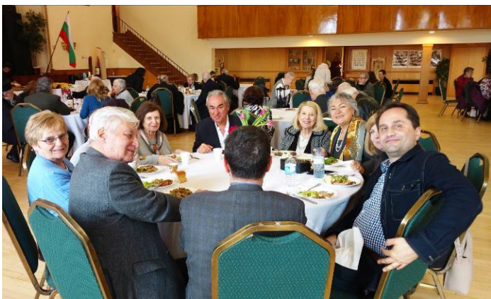
Church members with guest from St. Siluan / С гости от църкв. Св. Силуан