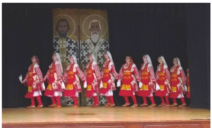
Dancing Group "Igranka" / Танцова група „Игранка“