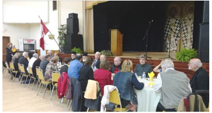
Dinner after the Vesper Service / Вечеря след службата