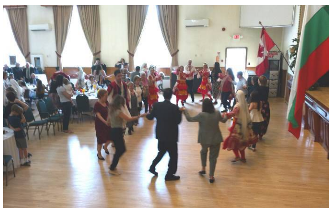
People dancing "Horo" with "Igranka" / На хорото с група „Игранка“