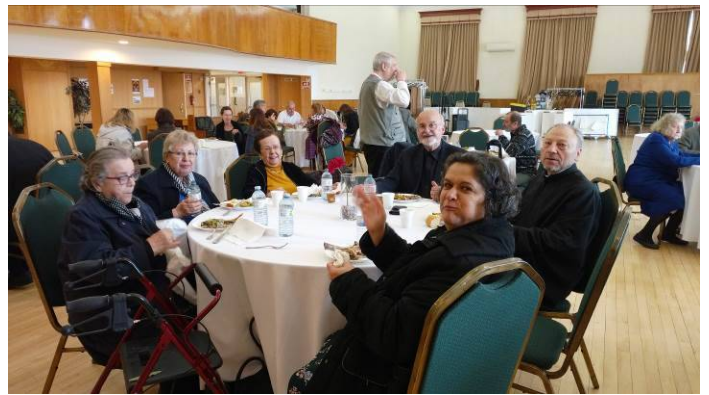
Long time members of the church / Дългогодишни членове на църквата