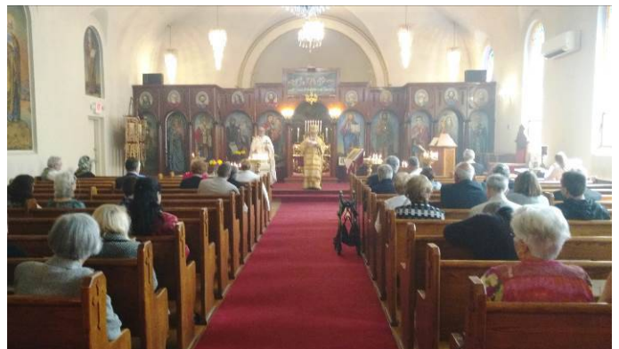
Sermon by Metropolitan Joseph / Проповед от Митрополит Йосиф