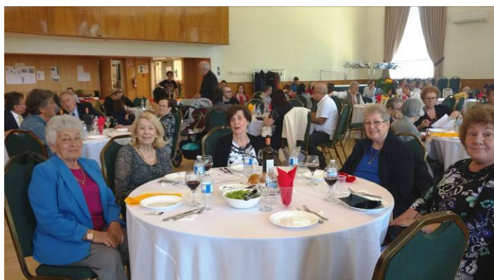
Church Long-time members / Дългогодишни членове на църквата