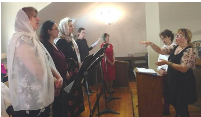
Chanting by Church Choir / Песнопения от църковния хор