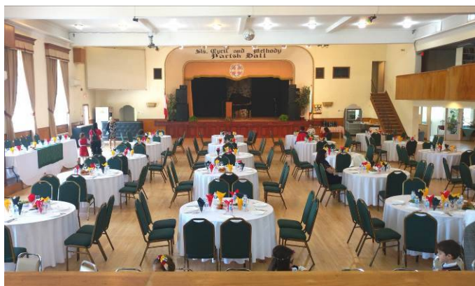
The Hall is ready for the Banquet / Залата е готова за банкетта