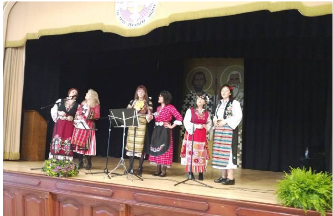
Vocal Group "Ot Izvora" / Вокална Група „От извора“