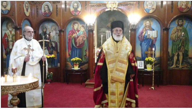
Sermon by Metropolitan Joseph / Проповед от Митрополит Йосиф