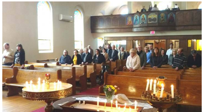
People attending the Liturgy / Хората присъстващи на Литургията