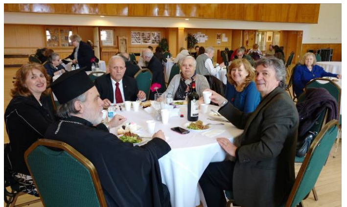
People enjoying the delicious lunch / Хората се радват на вкусния обяд