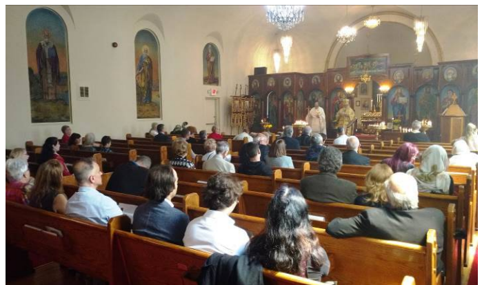
People attending the Service / Хората, присъстващи на службата