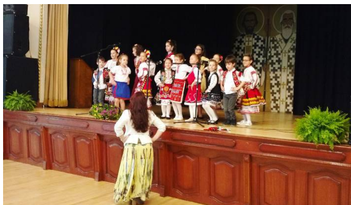
Children's Vocal Group "Bulgarche" / Детска Вокална Група „Българче“