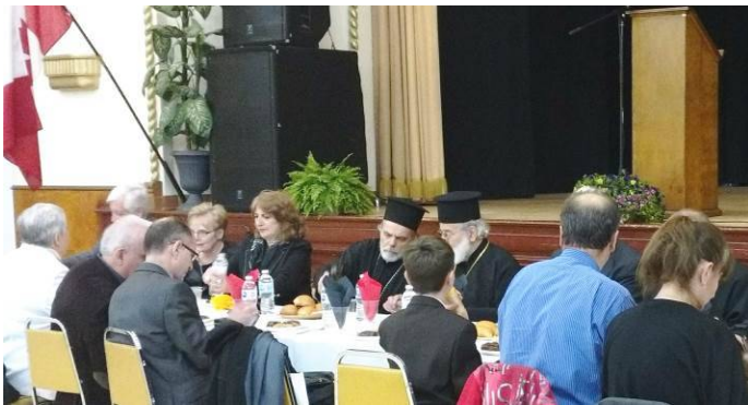
Dinner after the Vesper Service / Вечеря след службата