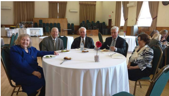
Long time members of the church / Дългогодишни членове на църквата