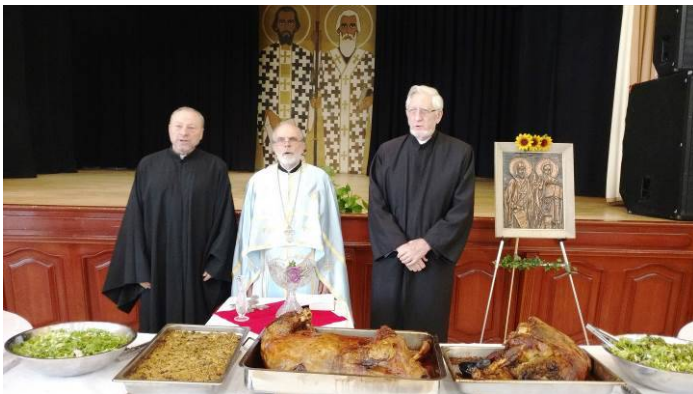
The priests, blessing the lunch / Свещениците благославят обяда