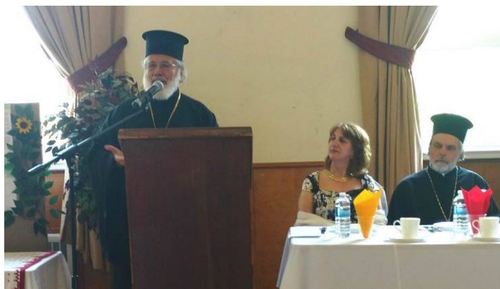
Greetings by Metropolitan Joseph / Поздравления от Митрополит Йосиф